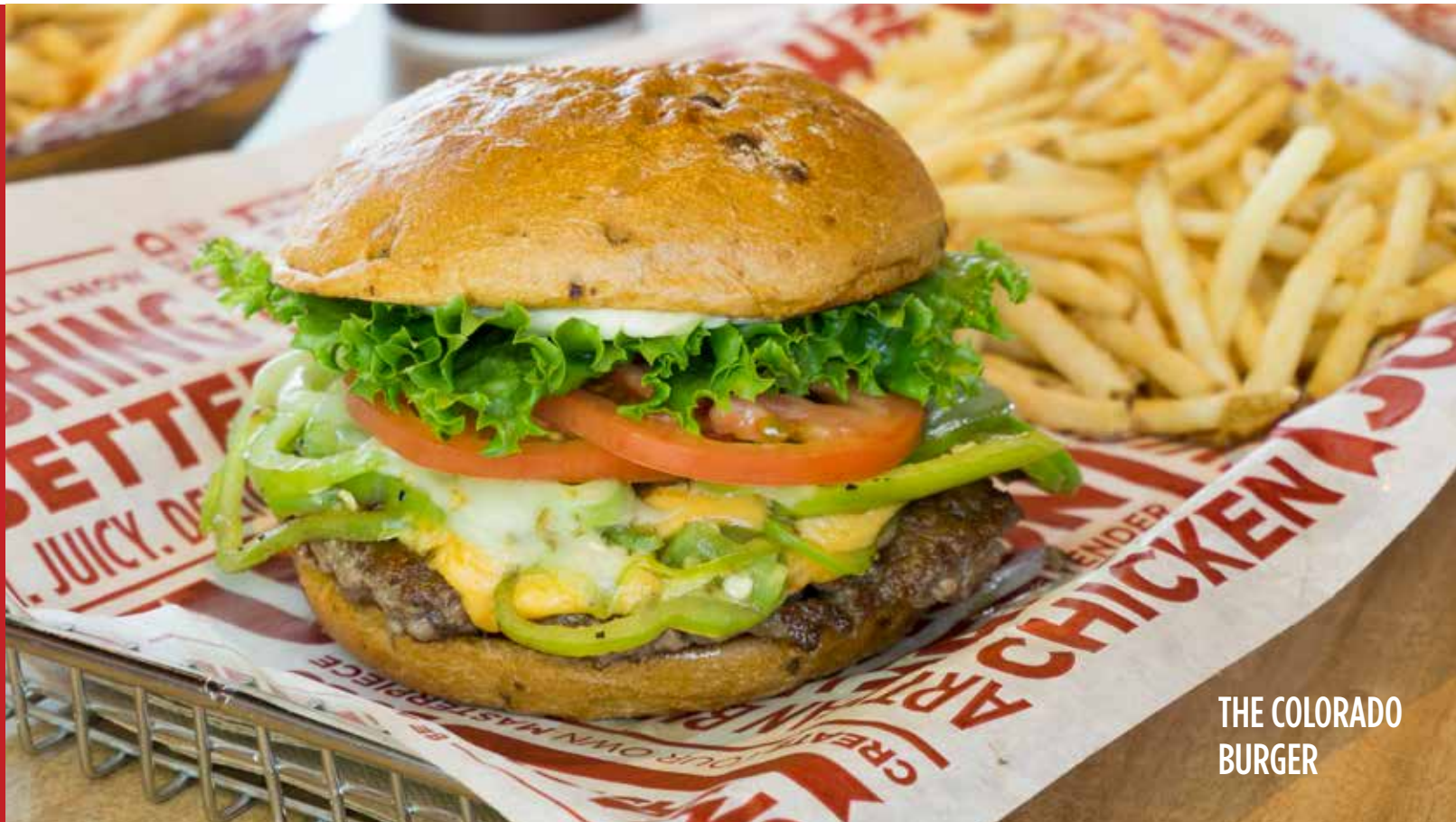
THE COLORADO BURGER